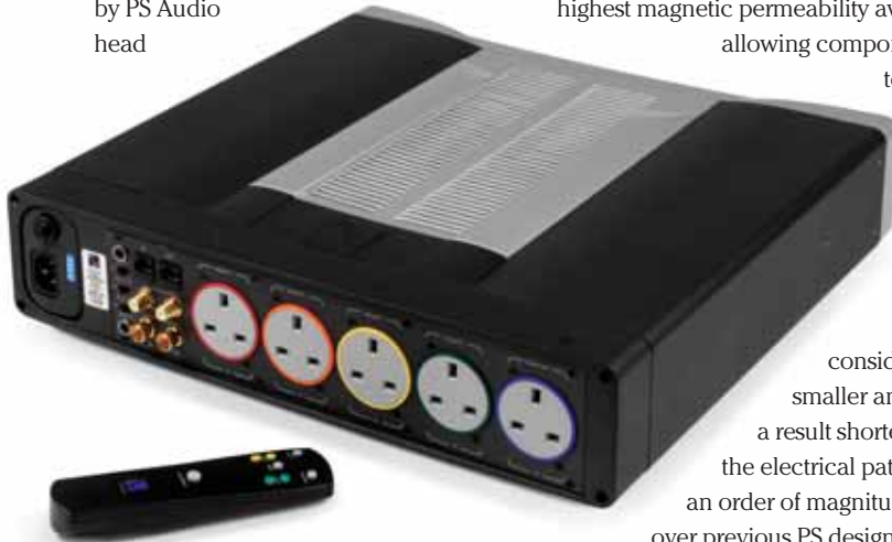
considerably smaller and, as a result shortening the electrical path by an order of magnitude over previous PS designs.

Where a unit like the Vertex AQ Elbrus is very much one cog in a wider conceptual picture, the PS Audio is a standalone add-on to just about any system. As such it's plug and play – and yes, you'll certainly hear its impact used in this way. But like all other aspects of the system foundation, it is also part of the whole, and combining it with a coherent set of high-quality mains leads is pretty much de rigeur if you want to really hear what the PPP is capable of. On its own it's impressive enough, as is a decent set of power cords. But combine the two and as with all the other components that contribute to establishing your system's foundation, ▶