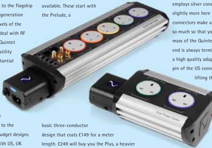
basic three-conductor design that costs £149 for a meter length. £249 will buy you the Plus, a heavier

There are also four power leads available. These start with the Prelude, a